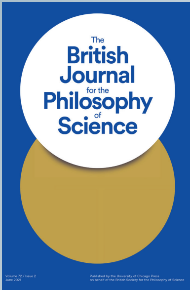
The British Journal for the Philosophy of Science